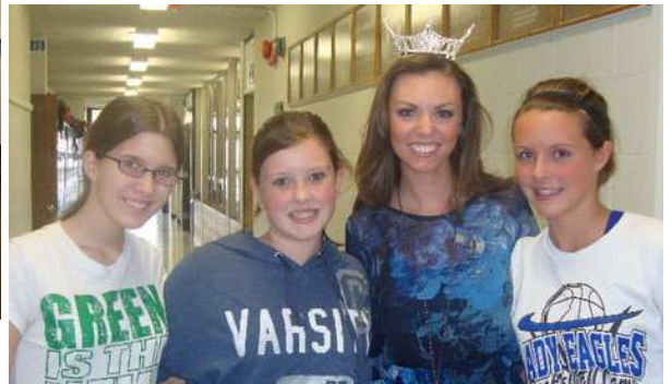
Top left: Ms Ohio with 94 Rock Staff Top right: Ms Ohio speaking at O'Neill Candlelight Vigil Middle left: Sacred Heart 4th graders in Norfolk with Ms Ohio Middle right: Ms Ohio with the Bullying Prevention Group members in O'Neill Bottom: Ms Ohio with members of BRAVO in O'Neill